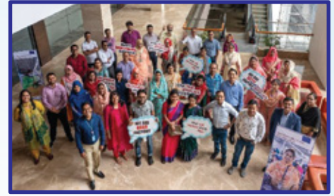
Trainees and Management Feedback Session