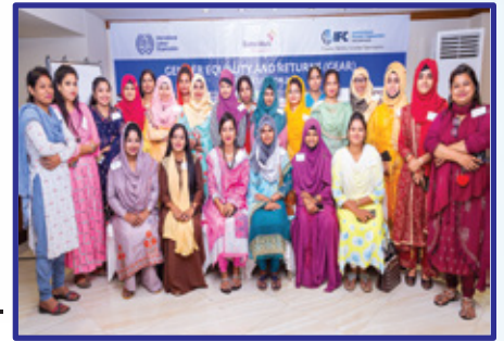
Newly Promoted Supervisors