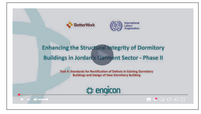
Task 4: Enhancing the Structural Integrity of Dormitory Buildings in Jordan's Garment Sector