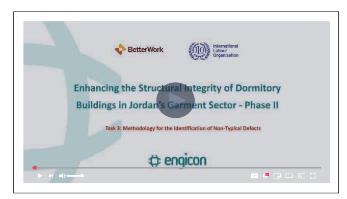
Task 3: Enhancing the Structural Integrity of Dormitory Buildings in Jordan's Garment Sector

Engicon has identified several problems in a sample of buildings surveyed, and came up with many recommendations for improving cleanliness, food and hygiene standards, safety and health as well as power, ventilation, and fire safety systems.