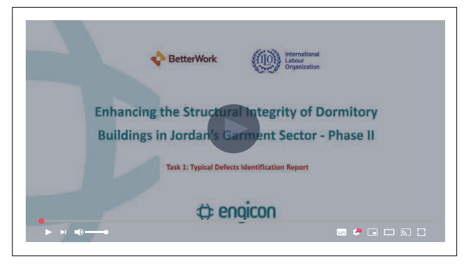
Task 1: Enhancing the Structural Integrity of Dormitory Buildings in Jordan's Garment Sector