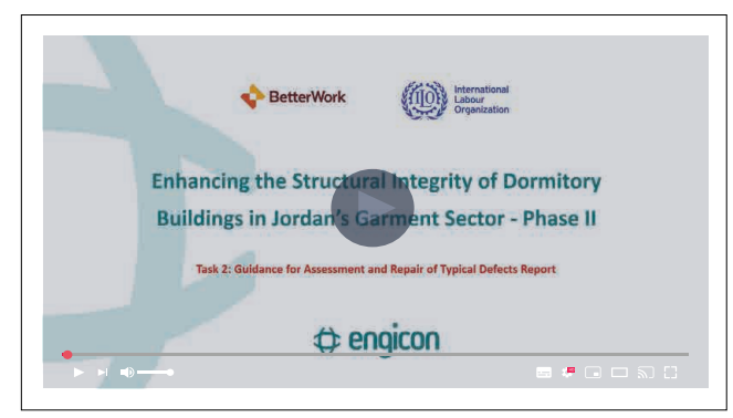
Task 2: Enhancing the Structural Integrity of Dormitory Buildings in Jordan's Garment Sector

At a recent seminar, the programme and J-GATE discussed assessment of structural integrity of worker dormitories, conducted by engineering consulting firm, Engicon,