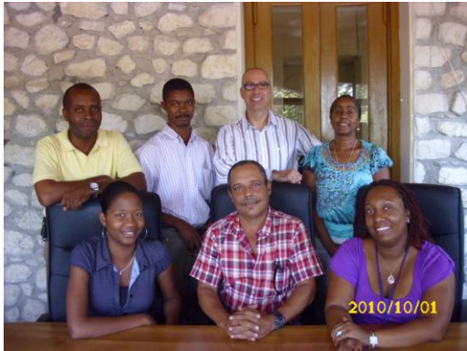
The Better Work Haiti team.